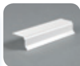
Sheet End Trim