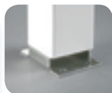
Canopy Post/ Foot