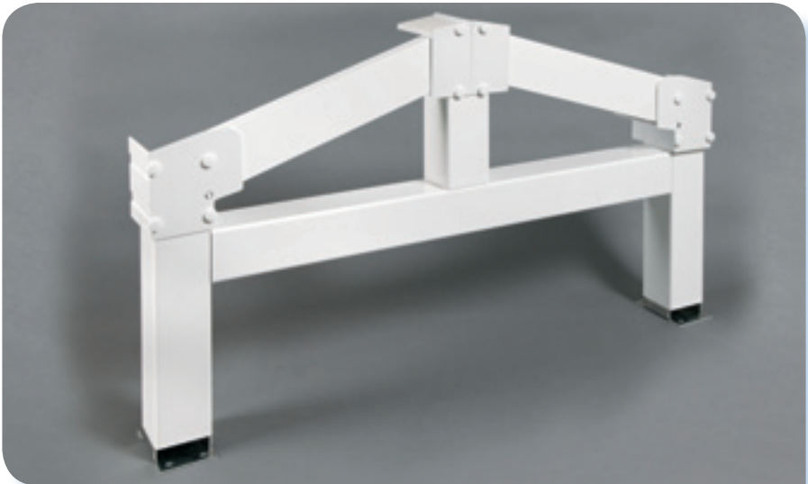
Gable Roof Design